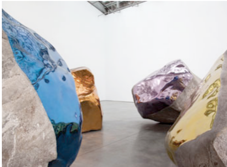
Hodges sheathed four granite boulders in lacquered stainless steel for ‘Untitled’ 2011.

acts of devotion. “I really identified with this enthusiasm and expressive celebration with color,” says Hodges.