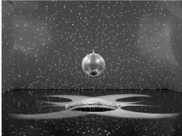
'Untitled', 2011, mirror ball, mechanics and water

ArtNews Jim Hodges: Under the Denim Sky 22 January 2014 Hilarie M. Sheets