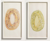
17 MIRA SCHENDEL Untitled (diptico ovais) 1980 Diptych, watercolour on paper, 46 x 23cm, 48 x 25cm (18 1/8 x 9in, 19 x 9 3/4in) SCHEN 92