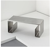
MARIA PERGAY Table Pliée / Folded Table 1968 Stainless steel and wood 40 x 100 x 40cm (15 3/4 x 39 3/8 x 15 3/4in) PERG 3