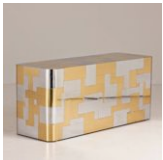
PAUL EVANS Block Console Table 1975 Brass and chrome 67 x 153 x 51cm (26 3/8 x 60 1/4 x 20in) EVAN 5