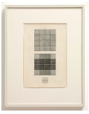
SOL LEWITT II 1969 Ink on paper Paper size: 30.5 x 20.2cm (12 x 8in) Framed: 49.1 x 39cm (19 3/8 x 15 3/8in) LEWITT 3