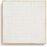
ROBERT RYMAN Untitled 1965 Oil on linen 26 x 26cm (10 1/4 x 10 1/4in) RYM 4