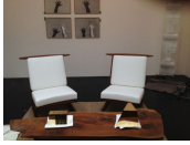
GEORGE NAKASHIMA "Conoid" cushion chair 1974 American walnut with webbed frame and upholstered cushions, pair 85.5 x 85.5 x 79cm each (33 3/4 x 34 x 31 1/8in) NAKA 1