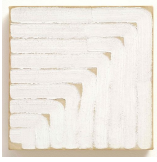
ROBERT RYMAN Untitled 1965 Oil on linen 25.8 x 25.8cm (10 1/8 x 10 1/8in) RYM 3