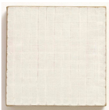
ROBERT RYMAN Untitled 1965 Oil on linen 26 x 25.8cm (10 1/4 x 10 1/4in) RYM 2