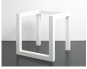
SOL LEWITT Incomplete Open Cube 8/5 1974 Baked enamel on aluminum 105.3 x 105.3 x 105.3cm (41 1/2 x 41 1/2 x 41 1/2in) LEWITT 2