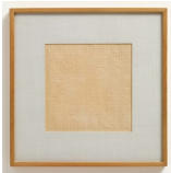
AGNES MARTIN Untitled 1961 Orange wash, black ink and white ink Paper size: 21 x 21cm(8 x 8in) Framed: 38.4 x 38.2cm(15 x 15in) AGNES 4