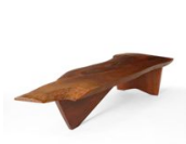
GEORGE NAKASHIMA Coffee Table 1974 American black walnut, double free-edge solid top with highly figured grain 33.5 x 177 x 66cm (13 1/4 x 69 3/4 x 26in) NAKA 2