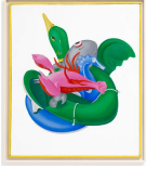
CHRISTA DICHGANS Stilleben mit gruner Ente 1968 Acrylic on canvas in artist frame 102.5 x 87.2cm (40 3/8 x 33 3/8in) Framed: 108.2 x 93.5cm (42 5/8 x 36 7/8in) DICH 2