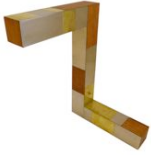
PAUL EVANS Cityscape Lamp 1960s Burl wood veneer, chrome-plate metal and brass 70 x 48 x 48cm (27 5/8 x 18 7/8 x 18 7/8in) EVAN 2