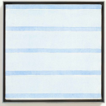
AGNES MARTIN Untitled Oil on linen 30.5 x 30.5cm (12 x 12in) Framed: 32.5 x 32.5cm (12 3/4 x 12 3/4in) AGNES 5