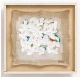
ROBERT RYMAN Untitled 1963 Oil on linen 21.5 x 21.5cm (8 1/2 x 8 1/2in) Framed: 27 x 28cm (10 5/8 x 11in) RYM 5