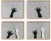
KEIJI UEMATSU Hand - Half and Half I 1976/2003 Gelatin silver print 47.5 x 61cm(each) (18 3/4 x 24in) Framed: 49 x 62.5cm (19 1/4 x 24 5/8in) Edition 3 of 4 UEMAT 2