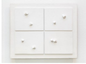
SERGIO CAMARGO Relief No. 163 1967 Painted wood/wood block 30.5 x 37.5cm (12 x 14 3/4in) CAMARGO 2