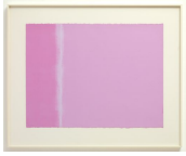
ANNE TRUITT 22 July '71 1971 Acrylic on paper 57 x 76cm (22 1/2 x 30in) Framed: 79 x 96.7cm (31 1/8 x 38in) TRU 18