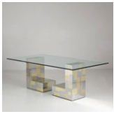
PAUL EVANS Pedestal table 1975 Glass, brass, and chrome 74 x 170 x 80cm (29 1/8 x 67 x 31 1/2in) Each base: 72 x 60 x 40.5cm (28 3/8 x 23 5/8 x 16in) EVAN 4