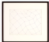
GERTRUDE GOLDSCHMIDT (GEGO) Untitled c.1971 Red ink and marker on paper 36.2 x 44cm (14 1/4 x 17 3/8in) Framed: 58.7 x 65.5cm (23 1/8 x 25 3/4in) GEGO 4