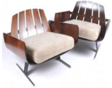
JORGE ZALSZUPIN Two 'presidential' armchairs Brazil, 1962 Rosewood, chrome plated metal 75 x 112 x 78cm each (29 1/2 x 44 x 30 3/4in) ZALS 1