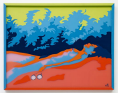
EVELYNE AXELL L'Herbe Folle (The Mad Forest) 1972 Enamel on plexi glass, formica 74.5 x 95.5cm (29 3/8 x 37 1/4in) AXELL 1