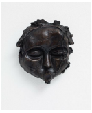
KENDELL GEERS Flesh of the Spirit 68 2010 Bronze, unique 24 x 22 x 8cm (9 1/2 x 8 5/8 x 8cm) GEERS 768