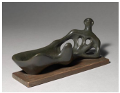
HENRY MOORE Working Model for Reclining Figure 1945 Bronze with Black Patina 20 x 13.5 x 44.5cm (7 7/8 x 5 3/8 x 17 1/2in) MOORE 5