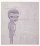
YOSHITOMO NARA Julien 2012 Acrylic on jute mounted on wood 180.5 x 160.5cm (71 x 63 1/4in) NARA 237