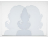
JIRO TAKAMATSU Shadow 1984/97 Acrylic on canvas 248.5 x 333.3cm (97 7/8 x 131 1/4in) TAKA 37