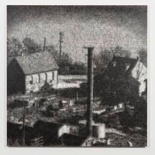
WAYNE GONZALES View of Easton, Pennsylvania, 1936 (after Walker Evans) 2015 Acrylic on canvas 183 x 183cm (72 x 72in) GONZ 93