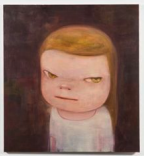
YOSHITOMO NARA The Dark Night 2015 Acrylic on canvas 120 x 110cm (47 1/4 x 43 3/8in) NARA 241