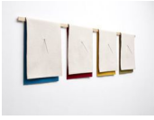
RIVANE NEUENSCHWANDER protection.protection.protection.protection. 2015 Felt, thread, coconut spike and wood 260 x 65cm (102 1/2 x 25 5/8in) NEUEN 366