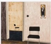
MAMMA ANDERSSON Dialog 2015 Oil on panel 122 x 146cm (48 x 57 1/2in) AND 60