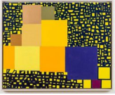
THOMAS NOZKOWSKI Untitled (9-34) 2014 Oil on linen on panel 55.9 x 71.1cm (22 x 28in) Framed: 59 x 74cm (23 1/4 x 29 1/8in) NOZ 16