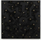
ROBERT BUCK The Letter! The Litter! ("1:45 am, last breath, eyes open, full moon") / East 2015 Acrylic, oil paint and gold grommets on store bought fabric 127 x 127cm (50 x 50in) BUCK 12