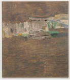
ANDREAS ERIKSSON Riveralter 2015 Oil and acrylic on canvas 300 x 260cm (118 1/5 x 102 1/2in) Framed: 303 x 263cm (119 3/8 x 103 1/2in) ERIK 89