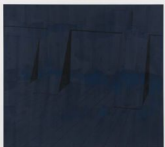
CORNELIUS QUABECK Big Studio Blues 2015 Acrylic on canvas 180 x 200cm (71 x 79in) QUAB 78