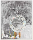
PAUL MCDEVITT CH6 5DJ 2015 Oil, collage and acrylic screenprint on canvas 100.5 x 80.5cm (39 5/8 x 31 3/4in) MCD 311