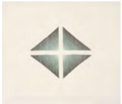
RUTH LASKEY Twill Series (Black) 2009 Hand-woven and hand-dyed linen 54 x 62.9cm (21 1/4 x 24 3/4in) Framed: 67.3 x 78.5cm (26 1/2 x 30 7/8in) LASKEY 2