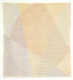
MARK BARROW YMCK8 2013 Acrylic on Hand-Loomed Fabric Textile by Sarah Parke 117.5 x 106cm (46 1/4 x 41 3/4in) BARROW 4