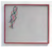
TONICO LEMOS AUAD Entardecer 2013 Linen, metallic thread, silk thread and cotton thread 50 x 57cm (19 5/8 x 22 3/8in) Framed: 53 x 60 x 3cm (20 7/8 x 23 5/8 x 1 1/8in) AUAD 57