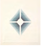
RUTH LASKEY Twill Series (Better Black) 2009 Hand-woven and hand-dyed linen 73 x 63cm (28 3/4 x 24 7/8in) Framed: 87.4 x 77.2cm (34 3/8 x 30 3/8in) LASKEY 1