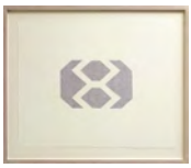
RUTH LASKEY Twill Series (Steel Gray) 2013 Hand-woven and hand-dyed linen 61 x 76.2cm (24 x 30in) Framed: 75.6 x 88.9 x 3.8 cm (29 3/4 x 35 x 1 1/2in) LASKEY 3