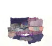
GETA BRATESCU Vestigii 1978 Textile collage on paper 20 x 27cm (7 7/8 x 10 5/8in) Framed: 37 x 52 x 3cm (14 5/8 x 20 1/2 x 1 1/8in) BRAT 3