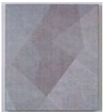
MARK BARROW GRB1 2011 Acrylic on Hand-Loomed Linen Textile by Sarah Parke 63.5 x 56cm (25 x 22in) BARROW 3