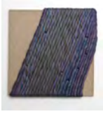
SHEILA HICKS Drunken Sailor 2013 Linen and cotton 93 x 93cm (36 5/8 x 36 5/8in) HICKS 2