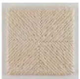
SHEILA HICKS Study for Convergence, Hermes 1996 Linen 95 x 95 x 6cm (37 1/2 x 37 1/2 x 2 1/2in) HICKS 1