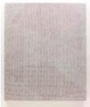
MARK BARROW YMCK2 2013 Acrylic on Hand-Loomed Linen Textile by Sarah Parke 76.2 x 64.8cm (30 x 25 1/2in) BARROW 2