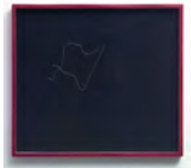
TONICO LEMOS AUAD Procissão Fluvial 2012 Linen, metallic thread and silk thread 50 x 57cm (19 5/8 x 22 3/8in) Framed: 53 x 60 x 3cm (20 7/8 x 23 5/8 x 1 1/8in) AUAD 48