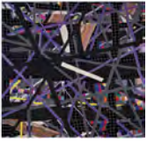
LUCAS SAMARAS Reconstruction #13 1977 Sewn fabrics 261.6 x 274.3cm (103 x 108in) SAM 5