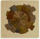
SHEILA HICKS Acier II 2013 Steel fibre and cotton 50 x 50cm (19 3/4 x 19 3/4in) HICKS 4