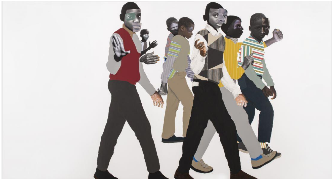
Deborah Roberts, 'When you see me', 2019. Mixed media collage on canvas, 165 x 304.8cm (65 x 120in). Copyright Deborah Roberts. Courtesy the artist and Stephen Friedman Gallery, London

"Her project is one that simultaneously highlights, disavows and recreates the hierarchies, standards and narratives created and disseminated by institutions that have served the interests and sustainment of white supremacy. Throughout the new works shown in 'If they come', Roberts constructs new archetypes – images of fictional black boys and girls of ages 9 to 12 – who take on poses of strength and power at the same time as showing vulnerability and ambiguity."