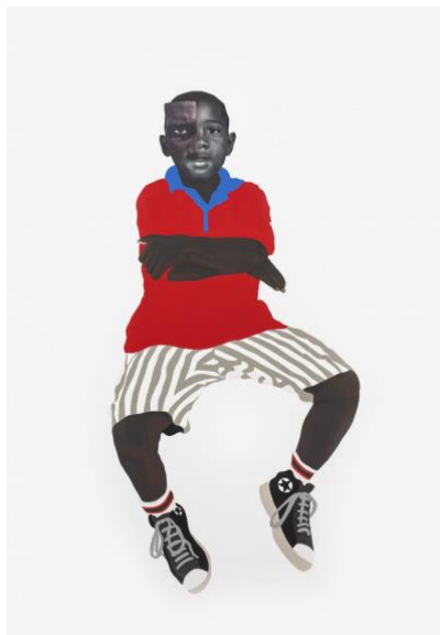
Deborah Roberts, 'King me', 2019. Mixed media collage on canvas, 165 x 114.3cm (65 x 45in). Copyright Deborah Roberts. Courtesy the artist and Stephen Friedman Gallery, London