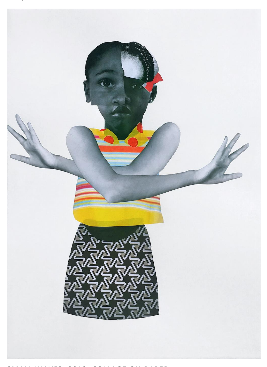
SMALL WAVES, 2018, COLLAGE ON PAPER.

Fragile but Fixable: The Collages of Deborah Roberts