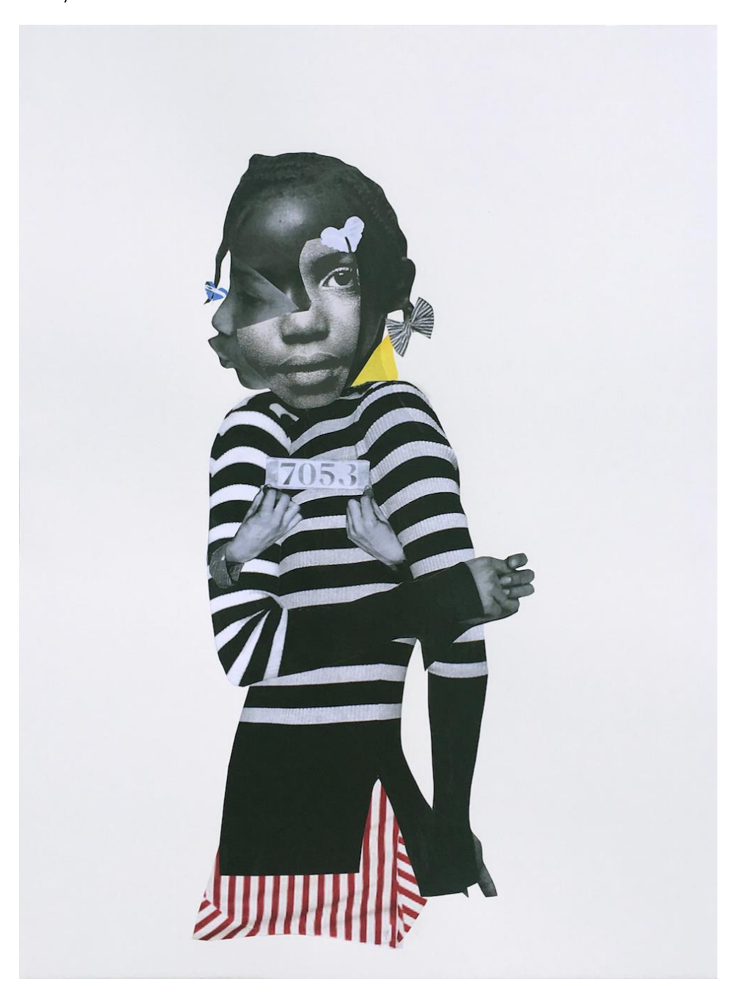
POLITICAL LAMB #3, 2018, COLLAGE ON PAPER.

Fragile but Fixable: The Collages of Deborah Roberts