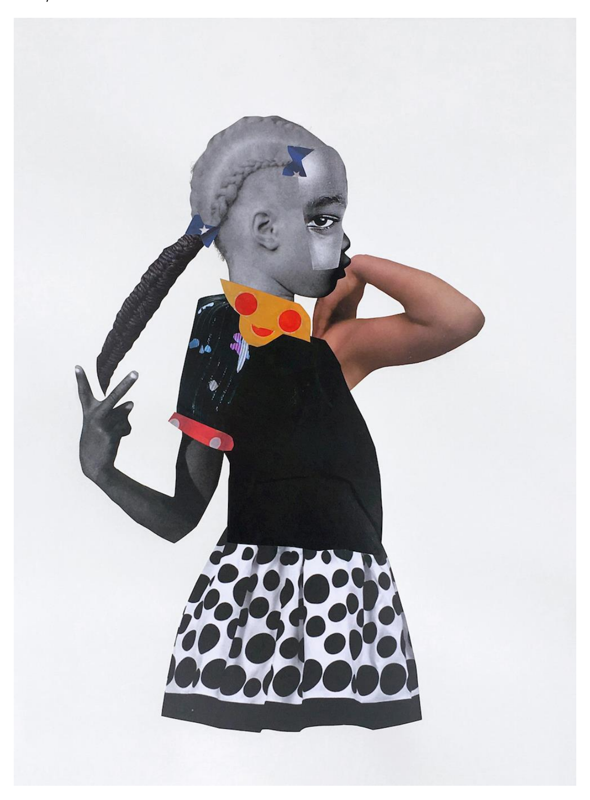
THE DOUBLE DARE, 2018, COLLAGE ON PAPER.

Fragile but Fixable: The Collages of Deborah Roberts