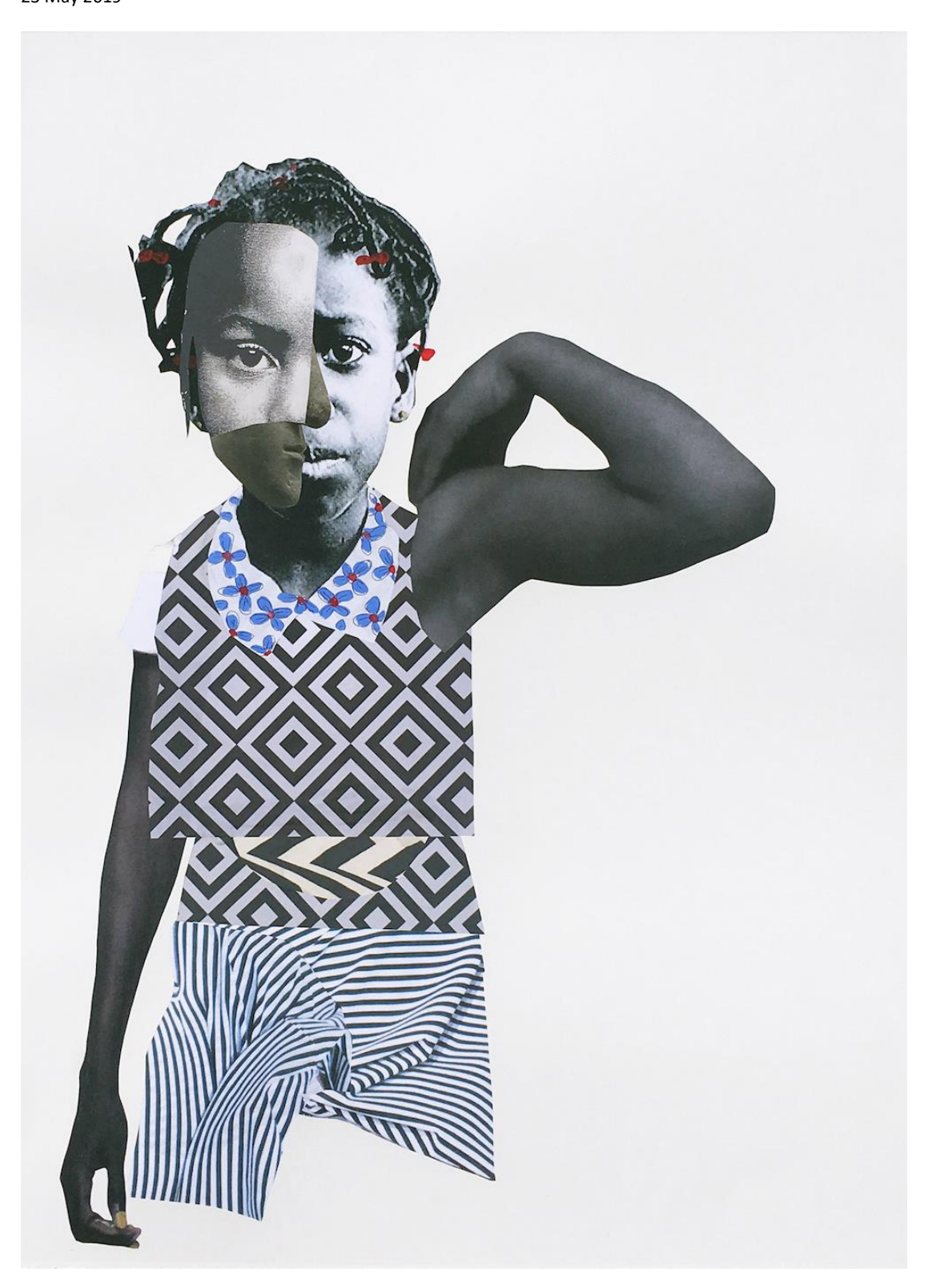
THE REDRESS, 2018, COLLAGE AND GOLD PIGMENT ON PAPER.

Fragile but Fixable: The Collages of Deborah Roberts