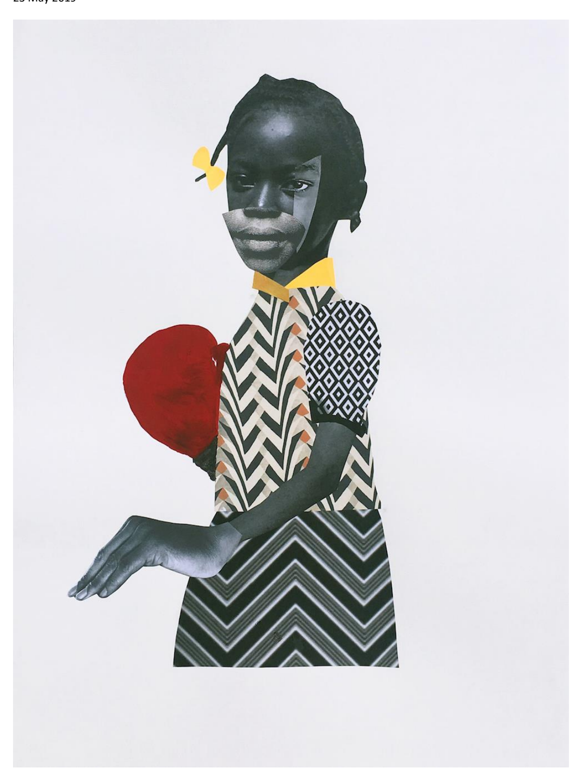
THE STEP BACK, 2018, COLLAGE ON PAPER.

Fragile but Fixable: The Collages of Deborah Roberts