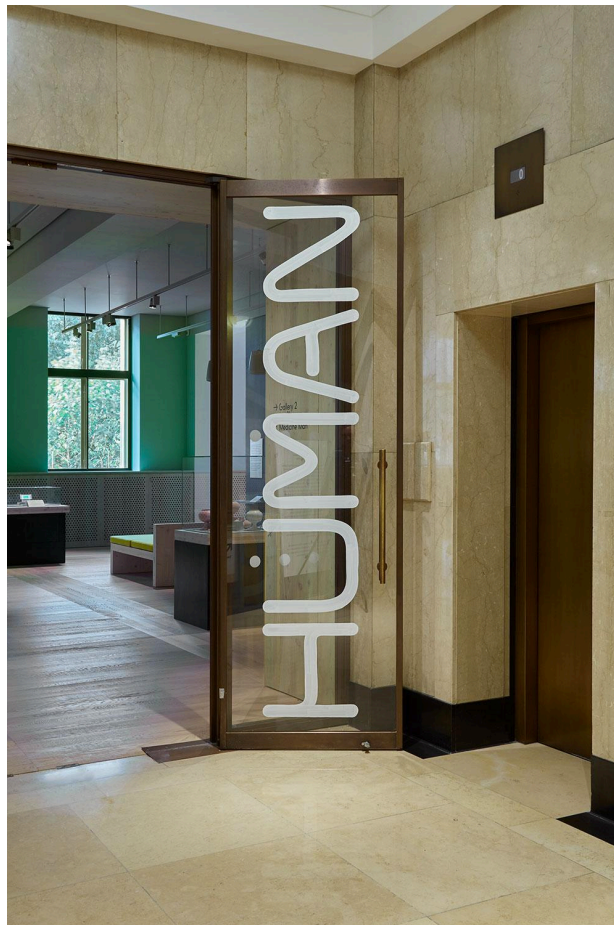
Being Human painted sign, by Erin Bradley-Scott

25—28 Old Burlington Street London W1S 3AN T +44 (0)20 7494 1434 stephenfriedman.com