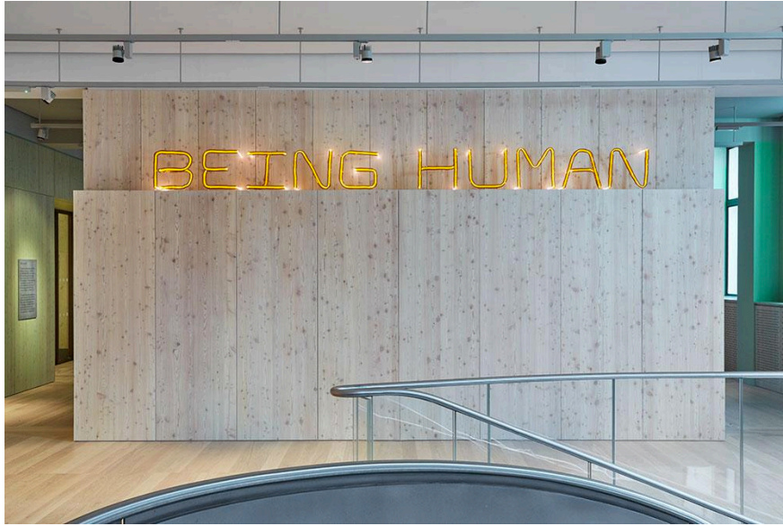
The Being Human helium sign, made by Jochen Holz

Wallpaper Assemble designs new Wellcome Collection gallery in London Clare Dowdy 3 September 2019