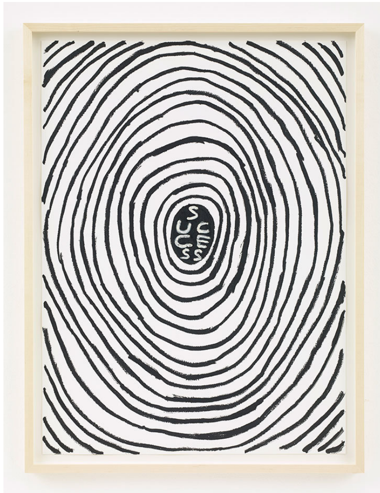
David Shrigley