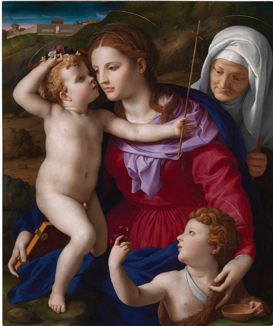
Image: The J. Paul Getty Museum, Los Angeles, acquired Bronzino's Virgin and Child with Saint Elizabeth and Saint John the Baptist (around 1540-45)