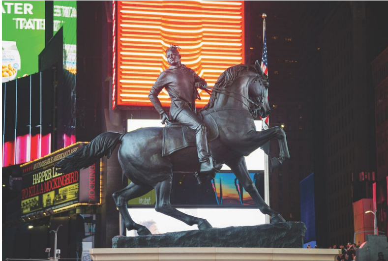
Image: The Virginia Museum of Fine Arts, Richmond, acquired Kehinde Wiley's Rumors of War (2019)

Our pick of the latest gifts and purchases to enter international museum collections- from an 800-year-old figure of Christ to a rediscovered Delacroix painting