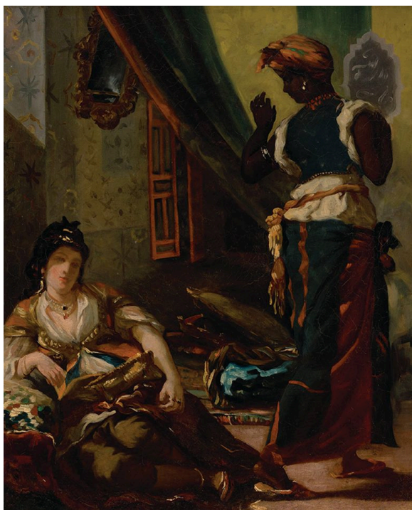
Image: The Museum of Fine Arts, Houston, acquired Eugène Delacroix's Women of Algiers in Their Apartment (1833-34)