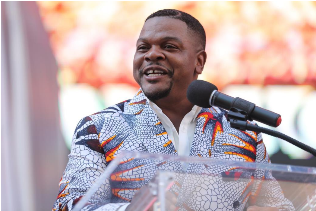
Kehinde Wiley speaking at the statue's unveiling in Times Square.

The eight-ton, 29-foot-high sculpture of a proud black man astride a rearing horse, entitled Rumors of War , is Wiley's bold and blasting call to arms against the army of Confederate statues that still populate Southern states, particularly Va., which boasts the most Confederate monuments, with 10 in Richmond alone. The statue's Broadway appearance, between 46th and 47th Streets, is a collaboration of Times Square Arts, the Virginia Museum of Fine Arts, and the Sean Kelly Gallery. In December, the sculpture will be permanently installed at the entrance to the Virginia Museum, just a stone's throw from Richmond's infamous Monument Avenue, lined with its enormous Confederate statues. Significantly, it will stand on the recently renamed Arthur Ashe Boulevard, which intersects Monument Avenue, creating a new, historical crossroads.