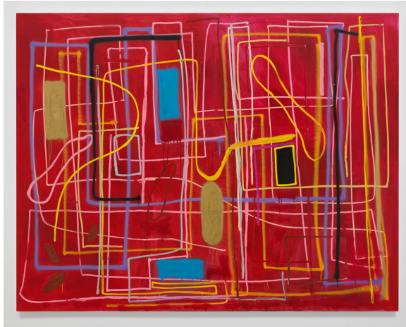
Image: André Butzer, Untitled (2019).

German painter André Butzer's summer exhibition at Metro Pictures includes nine large-scale paintings that explore the power of vivid color and playful figuration. After painting primarily in black and white since 2010, this exhibition marks a return to his early, Neo-Expressionist works characterized by thickly applied swathes of color and cartoon-like characters.