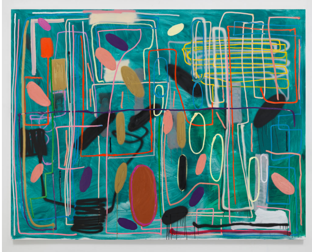
Image: Untitled (2019). Image courtesy the artist and Metro Pictures.

Take a load off and fill your screen with some color.