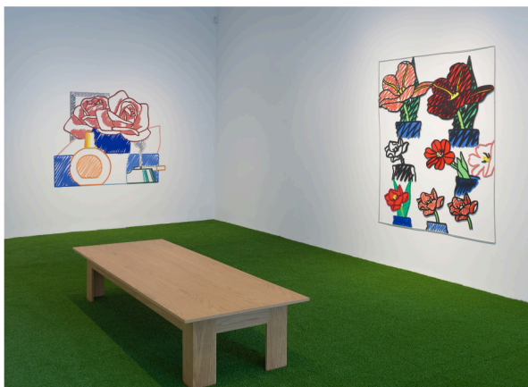
Image: An installation view of the Wesselmann show. Artworks © The Estate of Tom Wesselmann/Licensed by ARS/VAGA, New York.

advertising imagery and everyday household objects.