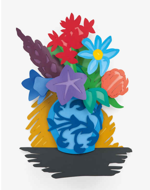
Image: Mixed Bouquet (Filled In) (1993).

Tom Wesselmann has been called Pop Art's unsung hero, despite the fact that he made a successful career for himself in the 1960s and palled around with Andy Warhol, Roy Lichtenstein, and Robert Indiana.