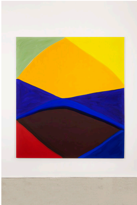
Image: Marina Adams, Days and Nights (2019). Image courtesy the artist and Salon 94.

Adams's unique power stems in part from the size of her work. One picture stands at eight feet tall, and is comprised of soft, organic forms that float among each other in periwinkle blue, forest green, ultramarine, and white. Another picture features a repeating theme of triangles that brings a sculptural liveliness to the colors at play.