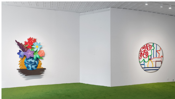
Image: An installation view of the Wesselmann show.

Tom Wesselmann has been called Pop Art's unsung hero, despite the fact that he made a successful career for himself in the 1960s and palled around with Andy Warhol, Roy Lichtenstein, and Robert Indiana.