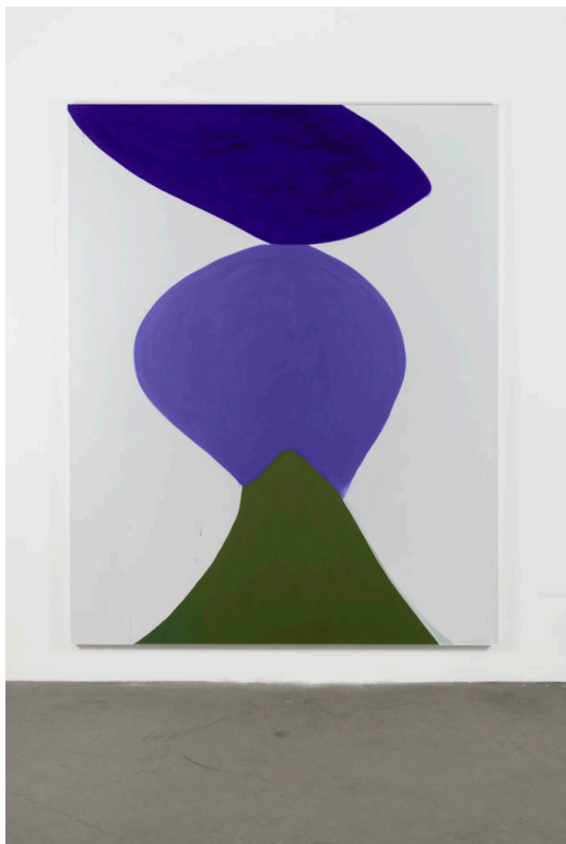
Image: Marina Adams, Mambo (2019).

Adams's unique power stems in part from the size of her work. One picture stands at eight feet tall, and is comprised of soft, organic forms that float among each other in periwinkle blue, forest green, ultramarine, and white. Another picture features a repeating theme of triangles that brings a sculptural liveliness to the colors at play.