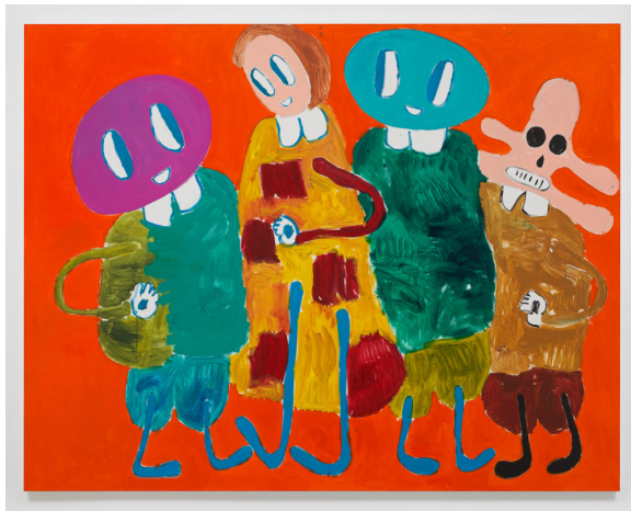
Image: André Butzer, Untitled (2019).

German painter André Butzer's summer exhibition at Metro Pictures includes nine large-scale paintings that explore the power of vivid color and playful figuration. After painting primarily in black and white since 2010, this exhibition marks a return to his early, Neo-Expressionist works characterized by thickly applied swathes of color and cartoon-like characters.