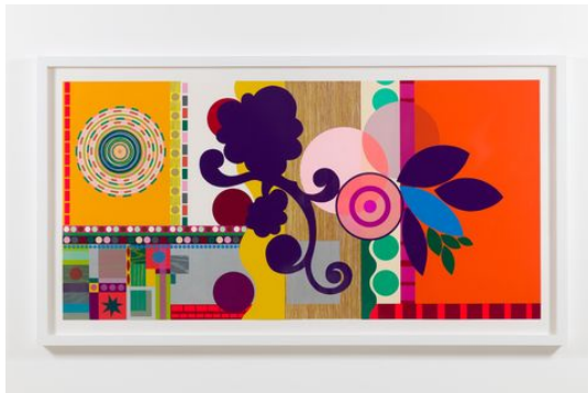
Image: Detail Of Beatriz Milhazes, 'Açúcar (Sugar), Canela (Cinnamon), Pimenta Vermelha (Red Pepper), Sal(Salt)', 2009. Woodblock, Woodcut And Screen Print, 80 X 778cm. Copyright Beatriz Milhazes.