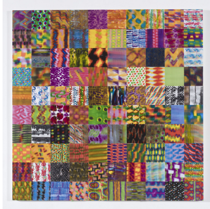
Image: Luiz Zerbini, 'Quadrícula', 2019. Acrylic On Canvas, 150 X 150cm (59 1/8 X 59 1/8in). Copyright Luiz Zerbini. Courtesy Stephen Friedman Gallery, London

Bring cultural inspiration straight to your living-room with one of these brilliant online shows