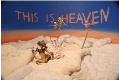
Image: Nathalie Djurberg & Hans Berg This Is Heaven, 2019 (Still) Digital Film, Audio Dimensions Variable 6 Minutes 36 Seconds

Lisson Gallery has launched its Spotlight Screenings, a six-week programme of artist-created films. The first season is titled 'Excess/access/absence', exploring themes of feast and famine. Streaming now is Djurberg &