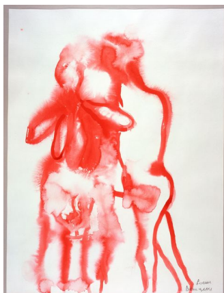
Image: Louise Bourgeois The Family 2007 Gouache On Paper 59.7 X 45.7 Cm / 23 1/2 X 18 In

Hauser & Wirth's digital programme 'Dispatches' will run throughout spring and summer, bringing you homemade artist videos and interactive conversations, as well as exclusive exhibitions. A highlight is this 1947–2007 collection by the French-American artist Louise Bourgeois, who drew daily throughout her seven-decade career. The show captures her inner psyche through undulating marks in ink, watercolour and pencil.