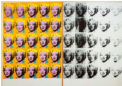
Image: Andy Warhol Marilyn Diptych 1962. Tate © 2020 The Andy Warhol Foundation For The Visual Arts, Inc. / Licensed By Dacs, London

Tate shut its galleries just five days after the opening of the first Warhol exhibition at Tate Modern in almost 20 years. Fortunately, the institution is now releasing a series of films offering audiences the chance to discover Warhol from the comfort of their own homes. Promising a new look at the extraordinary life and work of the Pop Art superstar, the retrospective includes works never seen before in the UK. The curator-led video tour is available now on Tate Modern's website and YouTube channel.