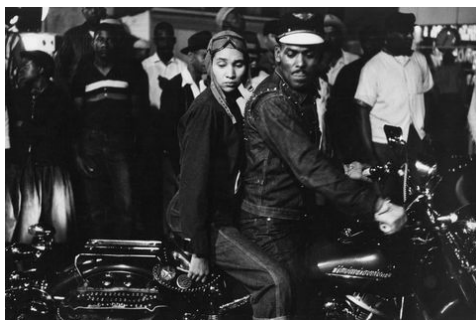
Image: Robert Frank, Indianapolis, 1956, Gelatin Silver Print, 8-5/8" x 13" (21.9 Cm x 33 Cm), Image 11" x 14" (27.9 Cm x 35.6 Cm), Paper © Andrea Frank Foundation, From The Americans