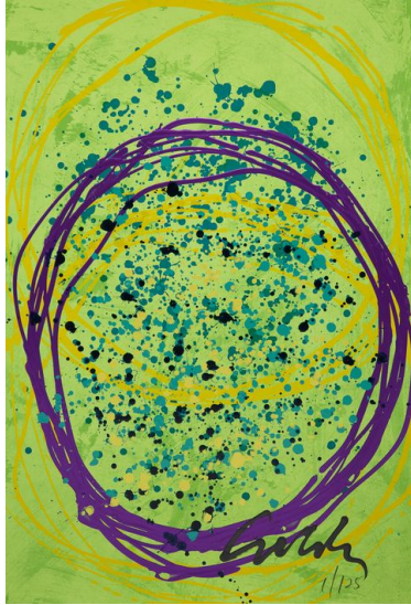
Image: Dale Chihuly, Echo Floats, 2018, Screenprint With Hand-Colouring, 94 X 63.5 Cm - 37 X 25 In © Chihuly Studio

Sims Reed Gallery presents 29 original prints and 10 original works on paper by the renowned American artist Dale Chihuly. Best known for his glass installations, Chihuly also made drawing integral to his artistic practice, after losing sight in his left eye in 1976. This exhibition seeks to reveal the synthesis of his two key creative disciplines.