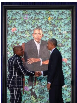
Image: Kehinde Wiley with Barack Obama in front of his portrait in 2018