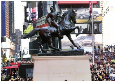
Image: Kehinde Wiley's sculpture 'Rumors of War' in Times Square, New York City in September last year. The work is a response to the monument of Confederate General JEB Stuart in Richmond, Virginia