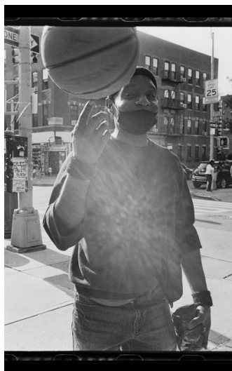
Image: Andre D. Wagner, "Old School, Bed-Stuy, Brooklyn, NY, 2020," 2020 (gelatin silver print).