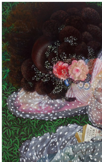
Image: Firelei Báez, "On rest and resistance, Because we love you (to all those stolen from among us)," 2020 (oil and acrylic on canvas).