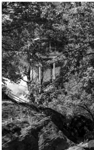
Image: Elliott Jerome Jr., "Sound of the Rain," 2020 (digital photograph).