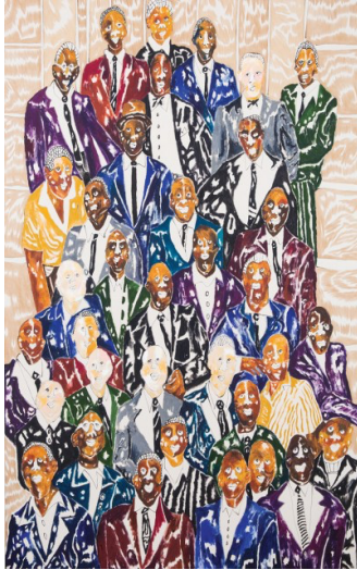
Image: Chase Hall, "A Great Day in Harlem," 2020 (acrylic and coffee on cotton canvas).

On View presents images from noteworthy exhibitions