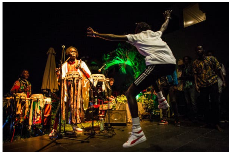
Image: A dancer performs as the Senegalese band Guiss Guiss Bou Bess plays at the opening of Kehinde Wiley's artist residency in Dakar.