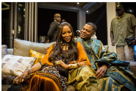
Image: Naomi Campbell with Kehinde Wiley at the opening of Black Rock.

Some of your paintings were inspired by Brazilian kids in the favelas. Could the streets of Dakar inspire your work?