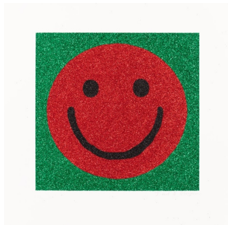
Image: Jake and Dinos Chapman's smiley face is illustrated in glitter in three different colours