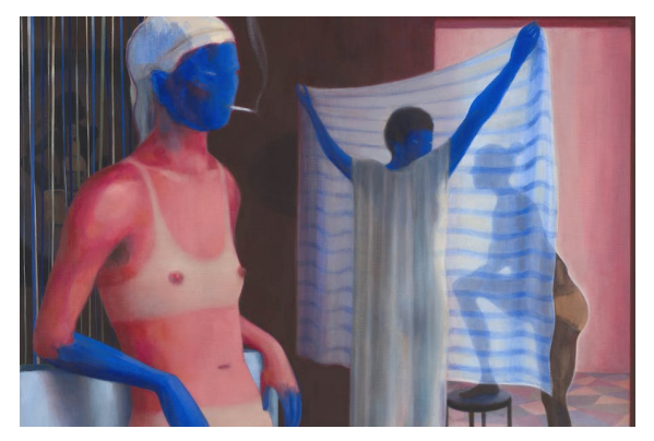
Image: Untitled (2019), Lisa Brice

Painted in vivid blue, Lisa Brice's enigmatic depictions of women – richly layered, though often sketchily rendered – work to unsettle the genre of the female nude. While their poses often make oblique reference to canonical Western works, their faces are generally turned from the viewer, absorbed in activities that range from the everyday (gazing in the mirror; smoking a cigarette) to the