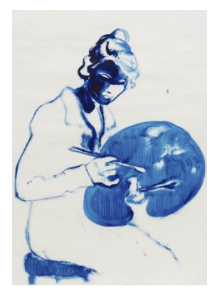
Image: Untitled (2019), Lisa Brice.

mysterious. The use of the colour blue is in part a reference to the Trinidadian carnival character of the 'Blue Devil', and reflects Brice's interest in the way that masks and disguises can serve as a form of liberation. Brice was born in Cape Town and divides her time between London and Trinidad; her first museum show in the Netherlands at the GEM Museum of Contemporary Art in The Hague includes a new painting exploring the work of the Dutch painter Charley Toorop, whom she first came across in the collection of the adjoining Kunstmuseum (21 November–5 April 2021). Find out more from the GEM website.