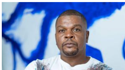
Image: Kehinde Wiley

The US artist is 'known for highlighting the absence or relegation of black figures within European art'.