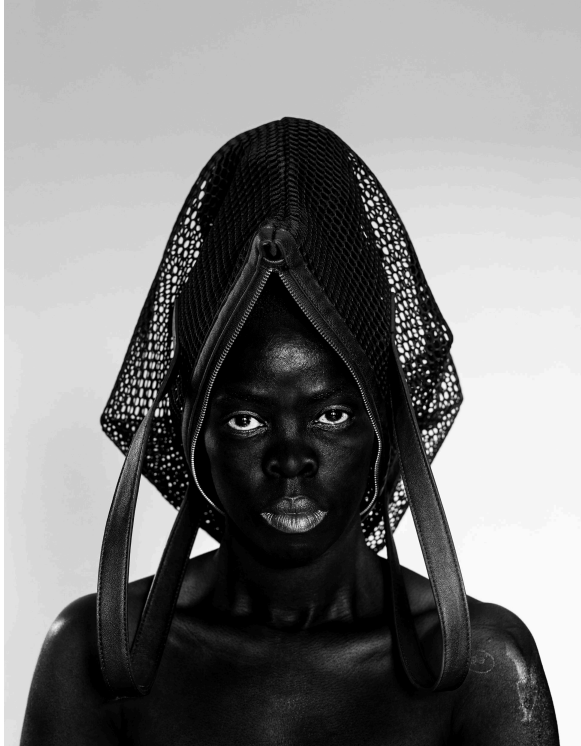
Zanele Muholi, Cebo II, Philadelphia, 2018

Lynette Yiadom-Boakye, Njideka Akunyili Crosby and Sonia Boyce feature in a group exhibition which borrows its title from bell hooks' 2003 book.