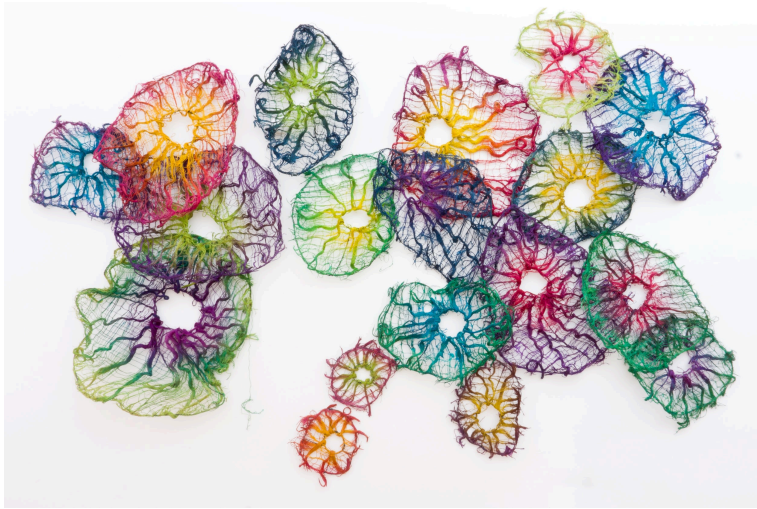
Nnenna Okore, Cycles and Cyclones

The seventh edition of the fair dedicated to sales of new work from Africa and its diaspora.