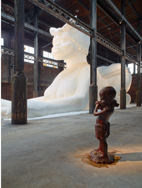
A Subtlety or the Marvelous Sugar Baby 2014

The American artist known for her paper cut-outs dealing with race and gender takes on the annual Turbine Hall commission.