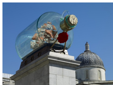
Image: Yinka Shonibare CBE, Nelson's Ship in a Bottle , 2009