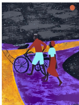
Image: Cassi Namoda, Lovers with ardent desires and strong will face obstacles along the way, safety in new lands are few and far between, Cyclone Eloise , 2021 a dedication to all those who have been impacted by climate change in Mozambique and it's neighbours, 2021

In a move to actively counter the limited financial support available to not-for-profits in the region, the auction will forego buyer's premiums, and 20 per cent donations from sales will go to support the critical work carried out by local organisations including Raw Projects in Dakar, Green Papaya in Manila and Casa do Povo in São Paulo.