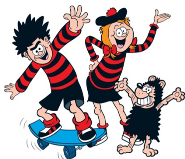
Image: Dennis, Gnasher and Minnie the Mix.

"Both art and Beano are about being told to do one thing, then doing another: both require a creative solution. Beano was for me a gateway into comics and a love of drawing, and from there a springboard into a love of art. Beano's irreverent sensibility is something that appeals to you as a child, but also, for some, never leaves you. To be able to present an immersive display of Beano's history, and to examine its influence on art and culture is the curatorial equivalent of a 'Beano feast'.