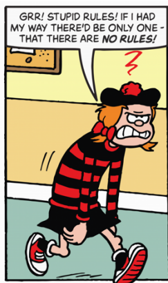
Image: Minnie the Minx, 2020.

First released in 1938 and still crafted weekly from its home in Dundee, Beano has entertained and inspired across the decades, forming a lasting impact on the contemporary cultural landscape and, crucially, on today's artists themselves, by always applying one simple rule – rules should be broken. This landmark exhibition explores both Beano's and contemporary art's unruliness and irreverence, through the eyes of extraordinary artists who embody the Beano sensibility of rebellion.