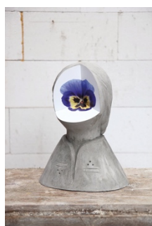
Image: Pansy (2020) by Anna Hulačová

Held on the sixth floor of Adrian Cheng's K11 Musea, Tracing the Fragments was the first exhibition Q Contemporary hosted in Hong Kong and the first comprehensive exhibition of central and eastern European art in the city. The ever-glam Law personally conducted a private tour on the opening night, explaining that the idea behind the show was to explore the similarities between contemporary central and eastern European art and contemporary Chinese art.