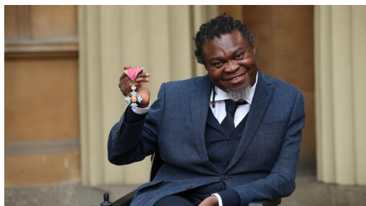
Image: Yinka Shonibare holds his CBE for services to art

Last year's show was delayed for the first time in its history because of the pandemic. Yinka Shonibare will co-ordinate the Royal Academy's Summer Exhibition this year. The artist, famous for his Nelson's Ship In A Bottle installation which stood on Trafalgar Square's Fourth Plinth, will explore the