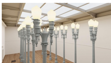
Image: TheVov's virtual presentation of Chris Burden's 14 Magnolia Doubles as part of the South London Gallery's digital revival of his solo exhibition (2006)

A non-profit platform for virtual exhibitions that combines a new micro-philanthropic model with cutting-edge technology, theVov aims to make culture accessible to a truly global audience thanks to a series of digital spaces hosted by tech specialist Vortic Art. Some of these spaces are exact replicas of real locations, some are otherworldly galleries, but all the bespoke digital extensions will be able to host live and pre-recorded talks and tours.