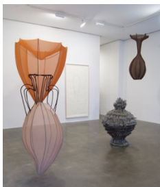
Image: Installation view of Maren Hassinger, We Are All Vessels, 2021, Susan Inglett Gallery, NYC