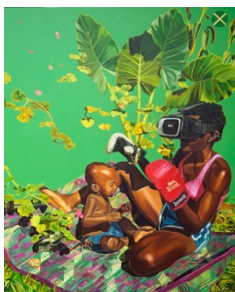
Image: Henry Mzili Mujunga, "Training day" (2020), oil on canvas