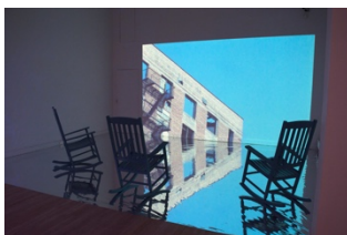
Image: Installation view of Miatta Kawinzi_ Soft is Strong at Cue Art Foundation When: through May 12

Where: CUE Art Foundation (137 W 25th Street, Chelsea, Manhattan)