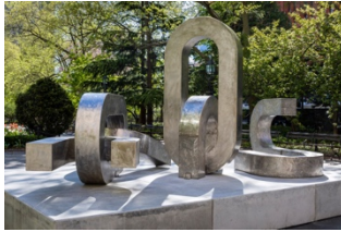
Image: Melvin Edwards, "Song of the Broken Chains" (2020), presented by Public Art Fund at City Hall Park, New York, 2021 ( ; artwork courtesy Alexander Gray Associates, New York; Stephen Friedman Gallery, London; © 2021 Melvin Edwards/ Artists Rights Society (ARS), New York)

Your list of must-see, fun, insightful, and very New York art events this month.