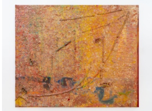
Image: Frank Bowling, "Enter the Dragon" (1984), acrylic, acrylic gel and polyurethane foam on canvas with marouflage, 90 3/4 x 109 3/8 x 3 7/8 inches (© Frank Bowling; image courtesy the artist and Hauser & Wirth; photo by Thomas Barratt)