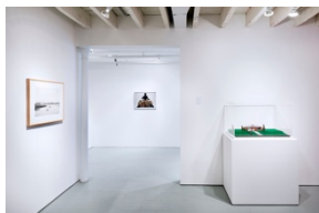
Image: Installation view of Hearts and Minds, 2021, Carriage Trade