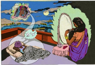
Image: Chitra Ganesh, "Combing Hair on Balcony" (2021)