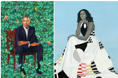
Image: At left, Kehinde Wiley's portrait of Barack Obama. At right, Amy Sherald's portrait of Michelle Obama.

The paintings by Kehinde Wiley and Amy Sherald are expected to draw large crowds at each of the five museums on the tour.