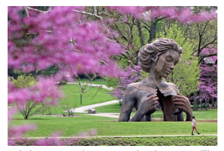
Image: Human + nature Morton Arboretum sculpture.

South African artist Daniel Popper has become known for his towering outdoor installations, often combining live organic materials such as concrete and steel with fern walls. A new collection of five sculptures decorating the grounds of Morton Arboretum presents Popper's largest biggest piece here is 28 feet wide and 37 feet long