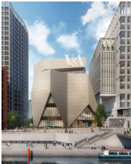
Image: A rendered image showing a performance in the V&A Storehouse. Credit: © Diller Scofidio + Renfro, 2018

Creative agency A Vibe Called Tech, whose work explores the intersection of black creativity, culture and innovation, has also recently joined the V&A East project. They will collaborate with young people on a series of digital content experiments that will inform V&A East's evolving creative programme.