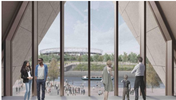
Image: An inside view of the V&A East Museum. Credit: © O'Donnell + Tuomey, Ninety90

Alongside collections, the venue hopes to empower young people and create career pathways into creative industries through initiatives like its V&A East Youth Collective Programme, a rolling six-month paid opportunity for locals aged 16-25. In addition, design collective RESOLVE has been appointed as V&A East's first Youth Workers in Residence, to help shape future youth programming.