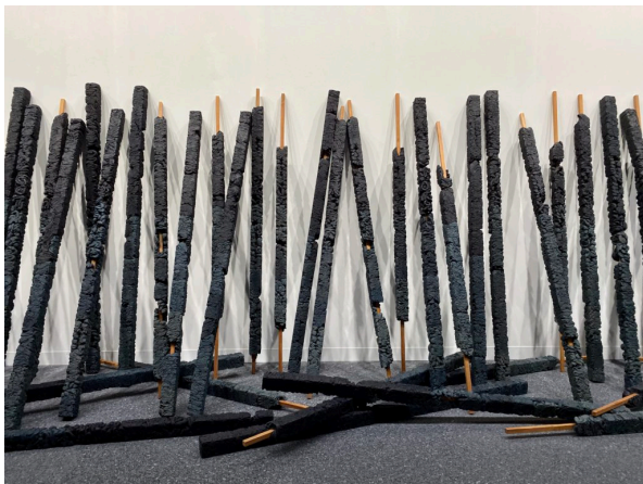
Image: Tom Friedman, Cocktail Party (2015), from Luhring Augustine, New York, and Stephen Friedman, London, at Art Basel Miami Beach Meridians.