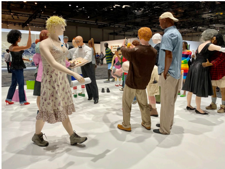
Image: Tom Friedman, Cocktail Party (2015), from Luhring Augustine, New York, and Stephen Friedman, London, at Art Basel Miami Beach Meridians.

See Highlights from Art Basel Miami Beach's New 'Meridians' Section, Where the Fair's Biggest (and Best) Artworks Shine