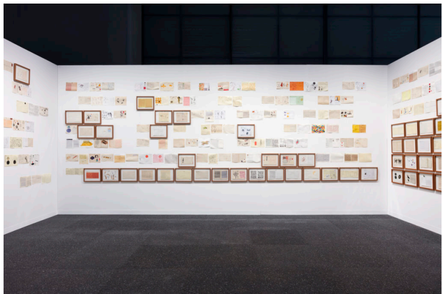
Image: José Antonio Suárez Londoño, Planas: del 1 de enero al 31 de diciembre del año 2005 [Exercises: from January 1 to December 31, 2005] (2005), on view at Art Basel Miami Beach Meridians from Galleria Continua, San Gimignano/Beijing/Les Moulins/Habana.