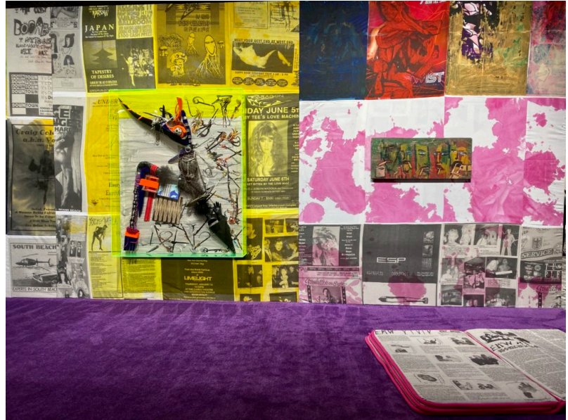
Image: Work by Fred Wilson and Pepe Mar at Art Basel Miami Beach Meridians.