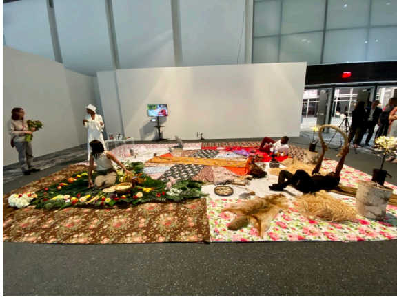
Image: John M Armleder, Stetson (2019), from Almine Rech, New York, at Art Basel Miami Beach Meridians.