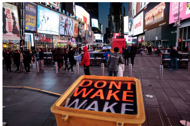
Image: An exhibition put on by the Spring/Break Art Show in New York's Times Square.