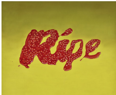
Image: Ed Ruscha, Ripe, 1967.

nine of which reside in museums collections. The work has been held in the same collection for 20 years and was last exhibited at the Menil Collection in Houston in 2000.