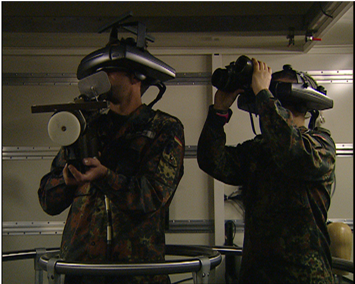
Image: Harun Farocki, War at a Distance , 2003, video still.

Curated by Peter Eleey and Ruba Katrib, 'Theater of Operations' is organized into three main sections: the invasion of 1990–91; the embargo years, when Iraq was isolated and impoverished by US-led sanctions; and the 2003–04 conflict, including the human-rights violations committed by the US military against detainees at Iraq's Abu Ghraib prison, a key flashpoint for Western artists. The show takes in painting and sculpture, mostly by Arab artists, and political responses by Western artists, mainly in tech idioms.