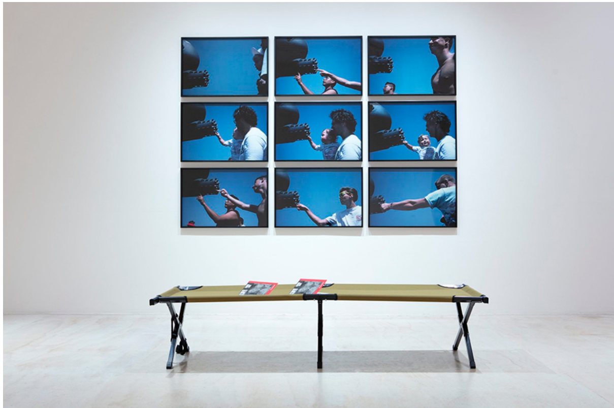
Image: Allan Sekula, War Without Bodies, 1991/1996, installation view, 'Theater of Operations: The Gulf Wars 1991–2011', MoMA PS1, New York