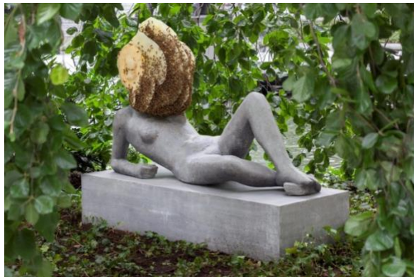
Image: Pierre Huyghe's, Untilled (Liegender Frauenakt) (2015).

Pierre Huyghe's Untilled at Documenta (13), (2012)