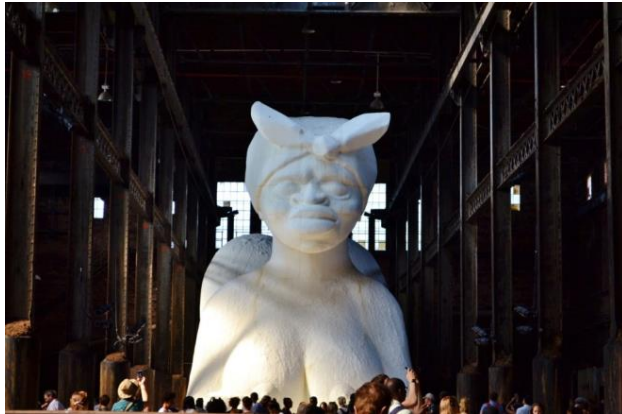
Image: Kara Walker's A Subtlety...or the Marvelous Sugar Baby (2014).

What individual artworks from this era will stand the test of time?