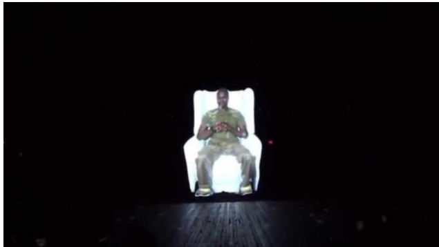
Image: Laurie Anderson, Habeas Corpus (2015).