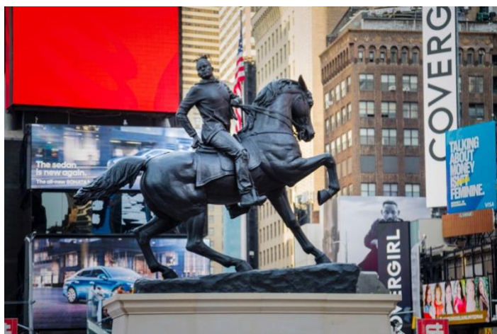
Image: Kehinde Wiley, Rumors of War (2019). © 2019 Kehinde Wiley. Courtesy of the Virginia Museum of Fine Arts, Times Square Arts, and Sean Kelly. Photo: Ka-Man Tse for Times Square Arts.

Kehinde Wiley's monumental bronze sculpture of a young African-American man wearing urban streetwear and sitting astride a massive horse was launched with pinpoint accuracy in New York City's Times Square. When it finds its permanent home at the Virginia Museum of Fine Arts in Richmond it will stylishly lead the way in advancing a broad range of critical art issues,