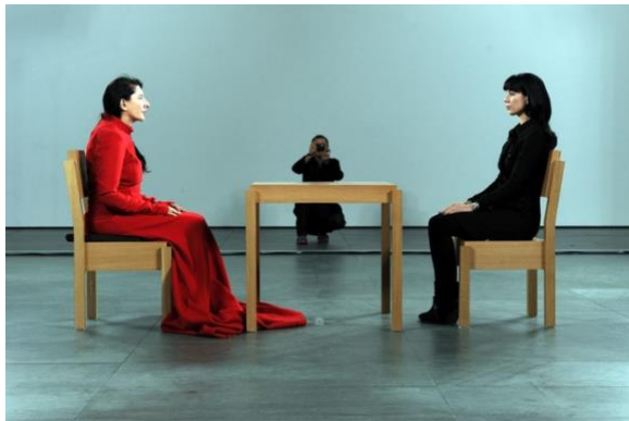
Image: Marina Abramović performs during the “Marina Abramovic: The Artist is Present” exhibition at MoMA.

Marina Abramović, The Artist Is Present (2010)