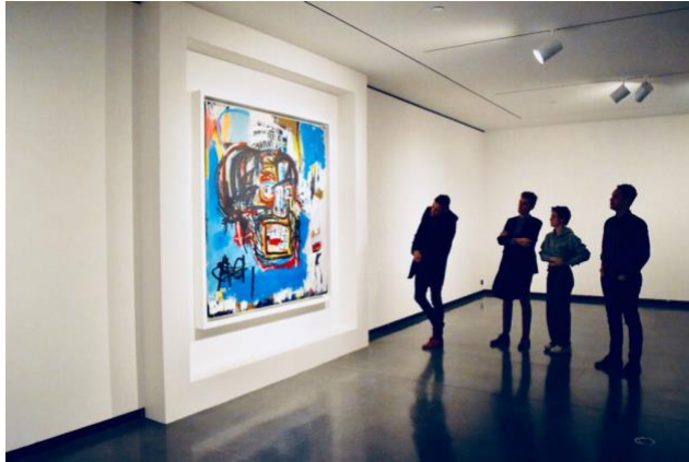
Image: Installation view of “One Basquiat” at the Brooklyn Museum.

That’s a really difficult one for me to answer. I can’t say there is only one. And sometimes artists are not as influential for their artworks as they are for other aspects of their endeavor. There have been several artists that have been influential for different reasons.