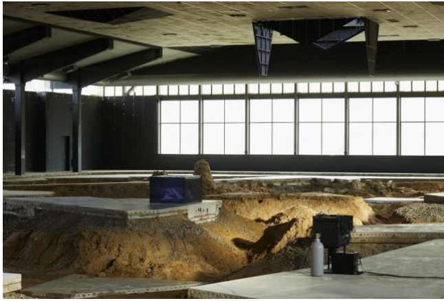
Image: Pierre Huyghe, After ALife Ahead (2017).

I hope it's Pierre Huyghe's large installations at the Skulptur Projekte in Kassel in 2017. It opened a door to the poetry of virtual worlds and also prophetically hinted at forms of biological computing that—I am hopeful again—will not suck so much energy that it makes our planet uninhabitable.