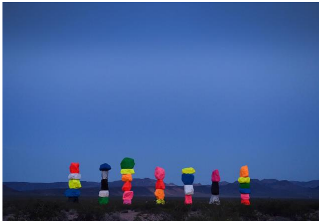
Image: The large-scale public art installation titled Seven Magic Mountains by Swiss artist Ugo Rondinone near Jean, Nevada.

Ugo Rondinone, Seven Magic Mountains (2016)