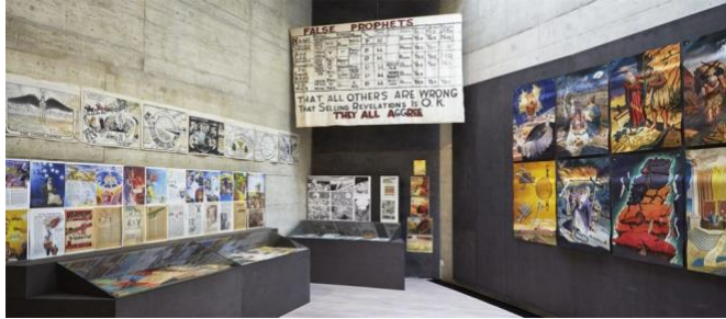
Image: Jim Shaw, The Hidden World (2013).

The Hidden World by Jim Shaw. Jim Shaw's didactic art collection, collected over more than three decades, comprises thousands of objects—books, posters, magazines, T-shirts, record sleeves, and other illustrations—as commissioned by various sects, secret societies and spiritual movements of all kinds. The didactic purpose of this collection makes it impossible to classify as an artwork. And being created by amazing talents, it is also impossible to consider these items as regular objects. It embodies this floating state Marcel Duchamp was pursuing when he asked “Can one make works that are not ‘of art’?”