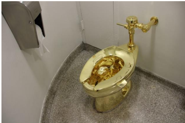
Image: Maurizio Cattelan, America toilet in the Guggenheim Museum, New York 2016.