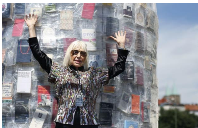
Image: Argentinian artist Marta Minujín poses inside the 'Parthenon of Books' at the Documenta 14 art exhibition in Kassel.

It's hard to pinpoint a specific art work, but I would say social practice. Over the past decade we've seen artists work more and more outside institutions, collaborate and make work to benefit different communities. I see this movement rooted in the work many Latin American artists were doing in the 1960s, such as Julio Le Parc and the collaborative GRAV, Techo de de la Ballena, Marta