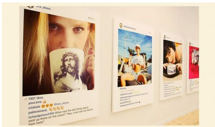
Image: Works by Richard Prince at Gagosian Gallery's Frieze booth.