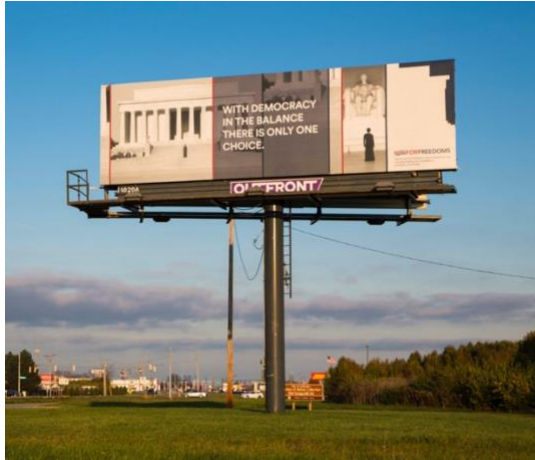
Image: Carrie Mae Weems, "With Democracy In The Balance There Is Only One Choice" (2018).

Launched in June 2018, during the midterm elections, it is the largest creative collaboration in American history and offers a new and compelling model for both art-making and political engagement. 52 artist billboards (1 per state, plus Puerto Rico and Washington, D.C.) were commissioned, and over 600 events were held nationwide with over 250 partners ranging from museums to university art galleries to public libraries to churches to individual artists. For Freedoms tapped into an under-appreciated national resource, namely our extensive civic infrastructure, to create diverse and decentralized platforms—unique to and created by