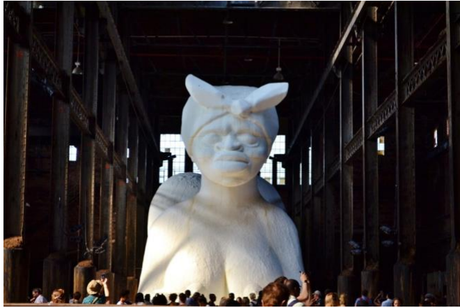
Image: Kara Walker's A Subtlety...or the Marvelous Sugar Baby (2014).

Kara Walker, A Subtlety. A Subtlety was an immersive arts exhibition on a dream scale. It took on challenging subject matter in a direct and demanding manner that pulled you in and did not let go. It is one of those works of art where an instant sense of community and kinship was established by those who experience it. A Subtlety presented a seamless dialogue between work and site. I hear of it time and time again as the inspiration for artists and