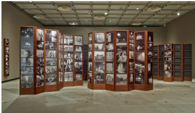
Image: Dayanita Singh, Museum Bhavan (2013–).

Singh has a unique approach to photography, which reflects upon and expands the way we relate to photographic images. Most recently, Singh has developed a new format, a mobile museum, entitled Museum Bhavan. It contains a collection of museums, including the Museum of Chance, Museum of Little Ladies, or Museum of Furniture. The Museum Bhavan entails a display system that allows her