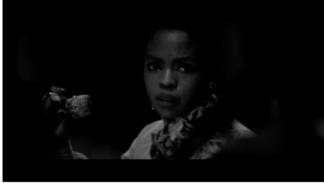
Image: Arthur Jafa's Love is the Message, The Message is Death (2016).

Arthur Jafa, Love is the message, the message is Death (2016)