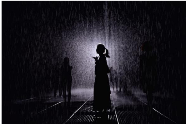
Image: Random International's "Rain Room" was displayed at the Yuz Museum in 2018.

Christian Marclay's The Clock . Random International's Rain Room . Andrea Bower's Open Secrets . Maurizio Cattelan's Comedian .