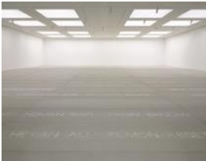
Image: Doris Salcedo, Palimpsest (2013–2017).

Doris Salcedo's Palimpsest, first presented at the Palacio de Cristal, Reina Sofia in Madrid, is the most emblematic artwork of the last decade in the way it addresses the scale and cyclical nature of violence, outrage, and forgetting in various contexts around the world from mass shootings to refugee crises. Using nanotechnology and water, she and her studio collaborators invented a way for victims' names (those who died crossing the Mediterranean to find refuge in Europe) to emerge from and dissolve into stone slabs. The work creates a space for public mourning where the shedding of tears meets