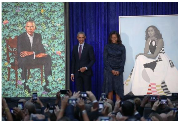
Image: Former U.S. President Barack Obama and former first lady Michelle Obama stand next to their unveiled portraits at the Smithsonian's National Portrait Gallery.

Amy Sherald, Michelle LaVaughn Robinson Obama (2018) & Kehinde Wiley, President Barack Obama (2018)