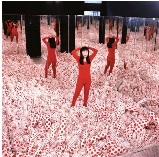
Image: Yayoi Kusama, Infinity Mirror Room (Phalli's Field), 1965.

Without a doubt, Yayoi Kusama's infinity rooms were inescapable in this decade. While she started making them in the 1960s—The Aldrich showed her in 1968—they have emerged to become the work for our selfie-obsessed moment.