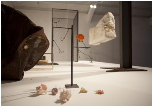
Image: Installation view, Carol Bove, The Foamy Saliva of a Horse (2011).

First presented at the 54th Venice Biennial, this was an artwork that literally and metaphorically stopped visitors in their tracks, refusing to be ignored. An eye-level plinth collected a free-association assemblage of found and exquisitely crafted objects. Comprising materials as varied as an oil can found on the Hudson River shore near the artist's New York studio, an exquisite arrangement of shells, a silver woven curtain, driftwood, display structures, peacock