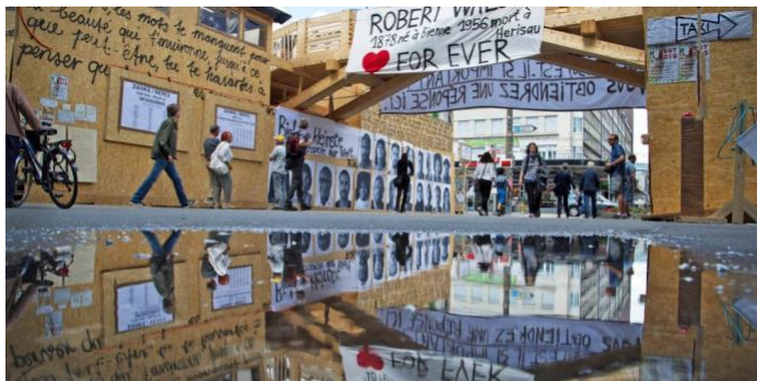
Image: Thomas Hirschhorn, Robert Walser-Sculpture (2019).