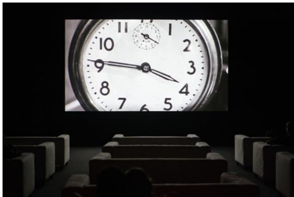
Image: Christian Marclay, The Clock (2011).

For me this is a toss-up between three paradigm shifting projects, which each speak to the idea of the artwork as event across media: Christian Marclay's The Clock (2010); Marina Abramovic's The Artist is Present (2010); and Kara Walker's A Subtlety (2014).