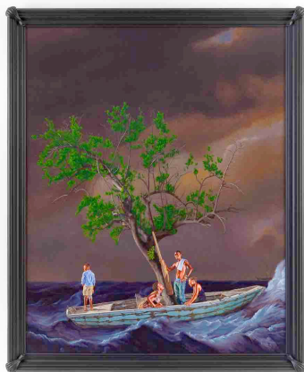
Image: Ship of Fools (2017), Kehinde Wiley. Royal Museums Greenwich, London. Courtesy the artist, Stephen Friedman Gallery; © Kehinde Wiley

'I cast [the models] in London – important that they be from London because the show is in London – all African in ancestry, and I flew them to the fjords of Norway where we have these incredibly gorgeous sheer white cliffs and their Black skin against these sharp white backgrounds. So those are the paintings, and then the film is also shot there because it's just heartbreakingly beautiful cinematographically. I'm fusing that with an earlier conversation that I had about the sea in which we had subjects that were cast in a small island off the coast of Haiti.'