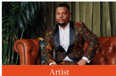
Image: Kehinde Wiley, photographed in New York in September 2021.

The twin peacocks painted on the chartreuse wall behind the gilded bar in the club room of the Soho Grand Hotel in Manhattan look like the background of a Kehinde Wiley painting. Against this backdrop of outrageous feathers and dazzling green I sit down with the artist, one morning in September, to talk about his work. In one corner of the room, three assistants gather over cell phones to book Wiley's next flight to Europe. In another, a dresser unzips a garment bag full of jackets for Wiley to choose from for the photo shoot to accompany this profile; blazers custom-made from West African textiles, some with satin lapels, plus a glossy bomber jacket for good measure, printed, coincidentally, with peacocks. Everything about this scene, including the fact that Wiley has attended MTV's Video Music Awards the night before – having redesigned the award statuette on the occasion of the network's 40th anniversary – conveys that I am in the presence of a celebrity. Yet the painter surprises me by describing himself as an introvert. 'I'd rather be in the studio, painting,' he says.