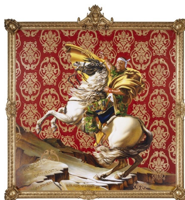
Image: Napoleon Leading the Army over the Alps (2005), Kehinde Wiley. Brooklyn Museum.

Wiley is arguably the most prominent visual artist of his generation. He is best known for the exuberant photorealistic portraits of young Black and brown men in heroic poses that he's been painting for the last 20 years, and for the technical skill with which he renders dark skin. His oeuvre raises questions about power, privilege and identity, and redresses the absence of central Black figures within European art. He counts Titian, Tiepolo, Van Dyck and Sargent among his influences. A Wiley canvas is instantly recognisable, typically framing its subject in a re-enactment of an Old Master painting – but clad in urban streetwear, and set against an ornately patterned decorative background drawing from sources as varied as Islamic architecture, Victorian wallpaper, and Renaissance tapestries. A classic example is his painting Napoleon Leading the Army over the Alps (2005), which imitates Jacques-Louis David's famous portrait, substituting Napoleon's figure with an unnamed African American sitter clad in Timberland boots and camo fatigues, astride a horse in front of a Rococo-style scrim. In a culture that refuses to stop criminalising Black men, a Wiley portrait scans like the opposite of a mugshot. That is, the paintings are embodiments of beauty, confidence and nobility, reflecting the desire to have Black subjects acknowledged as contributors to world history.