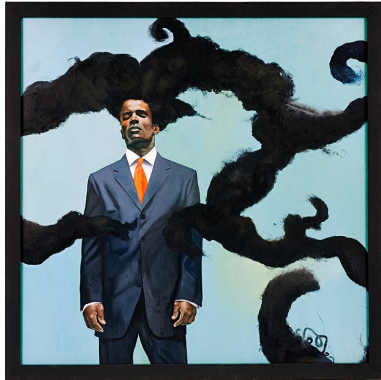
Image: Conspicuous Fraud Series #1 (2001), Kehinde Wiley. The Studio Museum in Harlem.