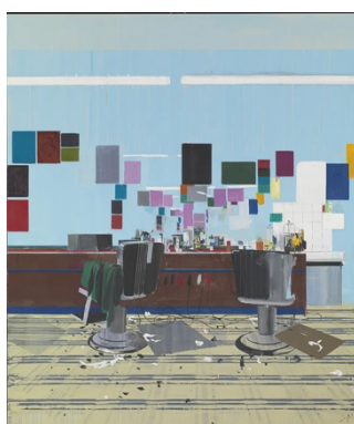
Image: 'Jersey' (2008), Hurvin Anderson. Tate collections.